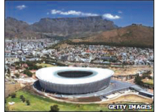
The soccer World Cup is expected to add 0,5% to RSA's growth rate this year.